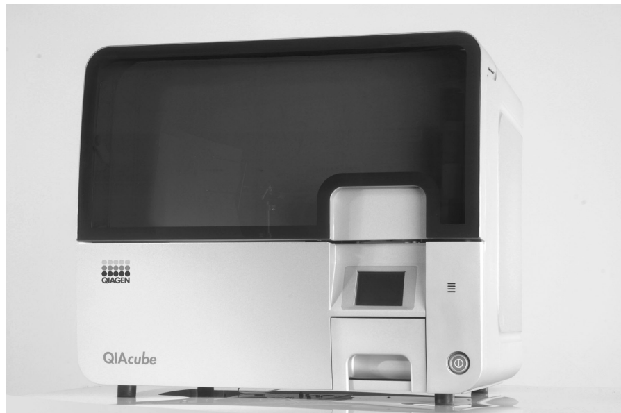
Figure 1. Automated DNA purification. DNA purification using the QIAamp DNA Stool Mini Kit can be automated on the QIAcube.